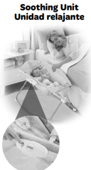
Above: Figure 11

137. The manuals are also misleading in ways beyond the inadequate and misleading warning section. For example, the manuals show images of mothers lying down in bed, covered with blankets, which indicate either that they are ready for sleep or awakening from sleep. Below is an example: 55